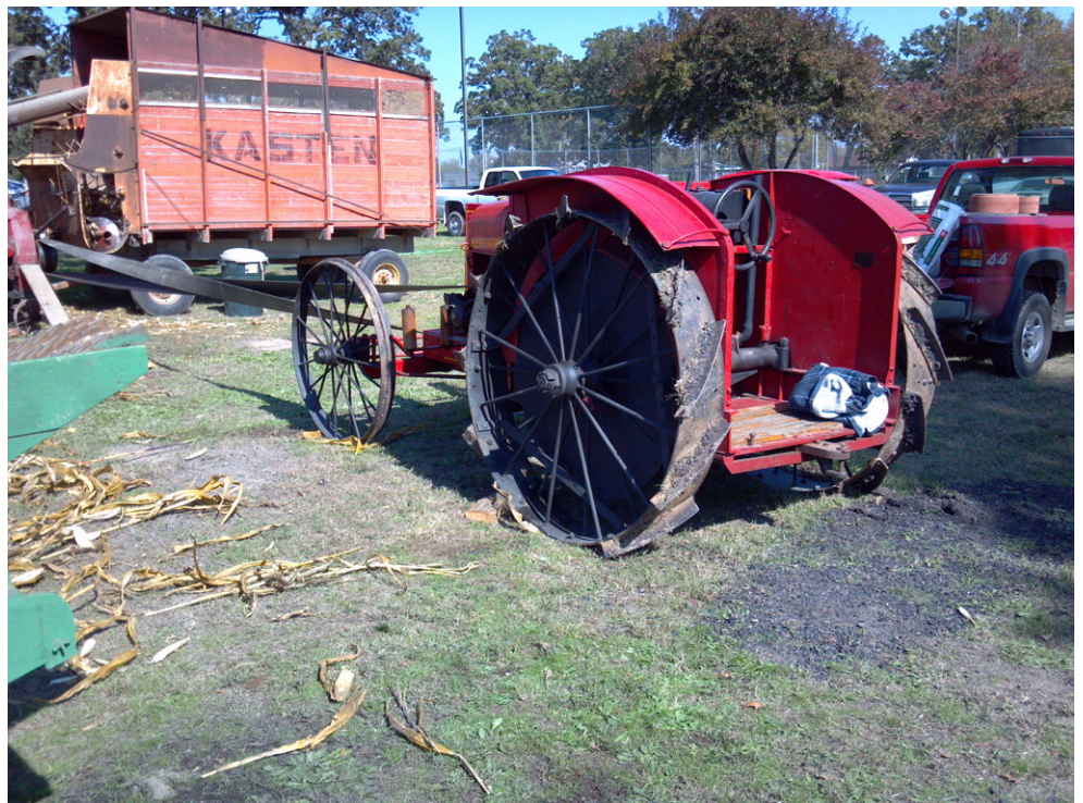
Massey Harris #2 Tractor belted up to a silage chopper