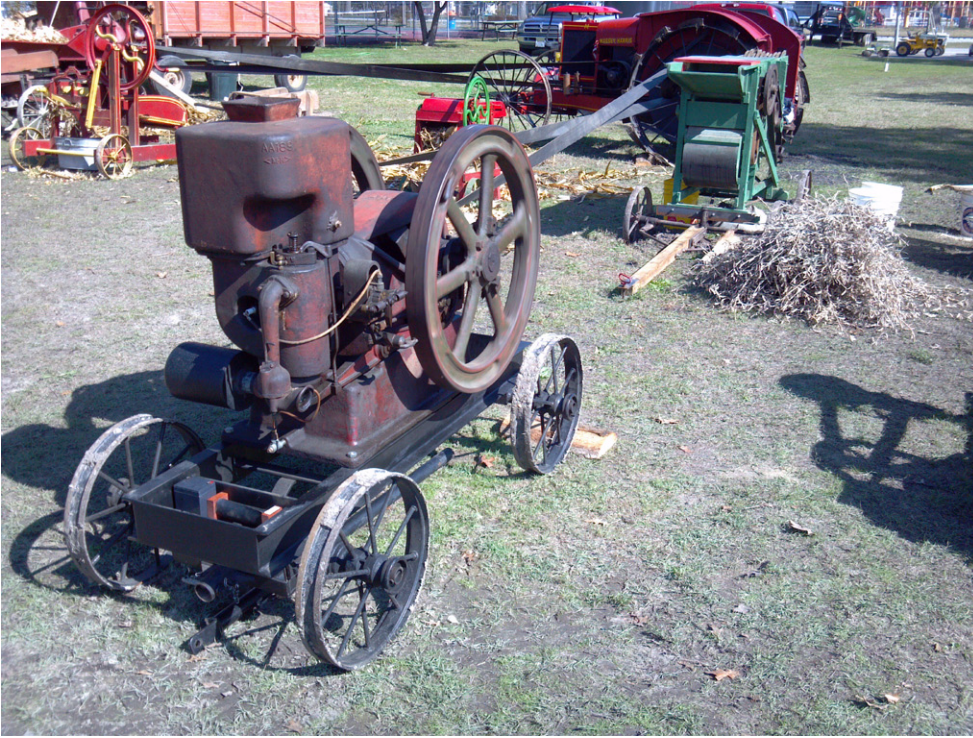
6 hp Massey Harris Type 1 Engine belted up to a bean thresher