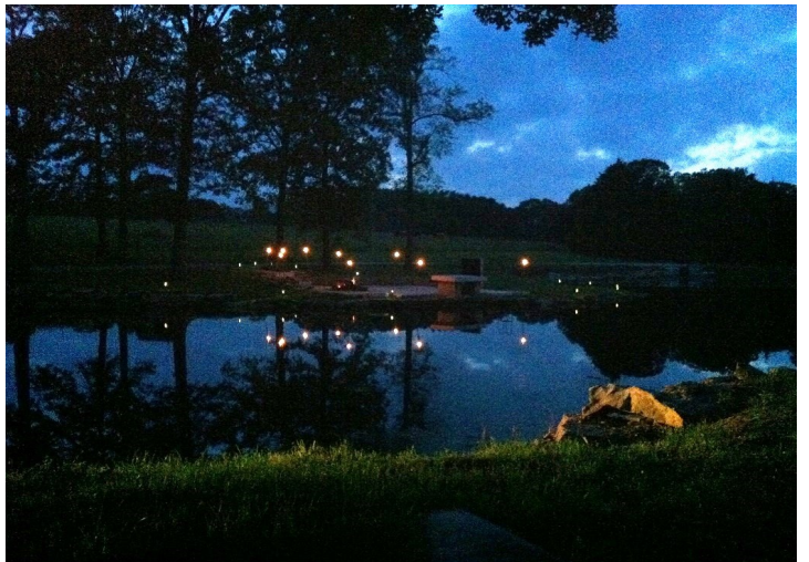
A beautiful evening at the pond!