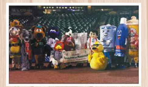
2:00 – 2:30 PM Louisville League of Mascots

11 AM -12:30 PM Corydon Dulcimer Society