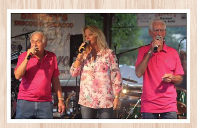
6:00 – 9:00 PM The Doo Wops/Wulfe Bros. Band