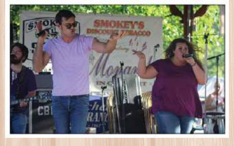
6:00 - 9:00 PM - The Juice Box Heroes