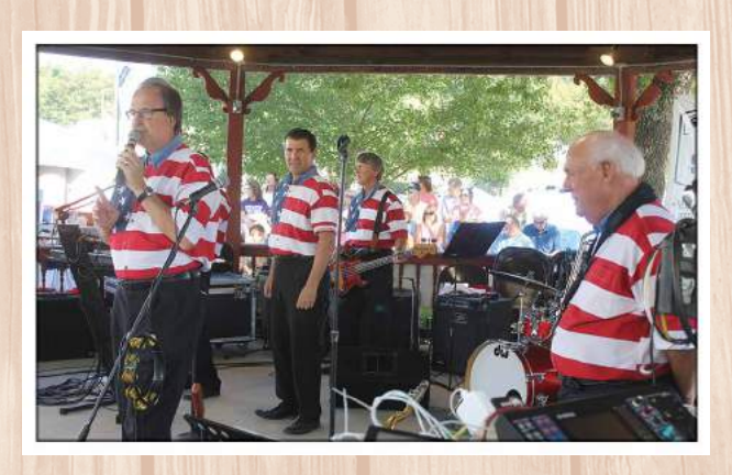
2:30 - 5:00 - The Monarchs