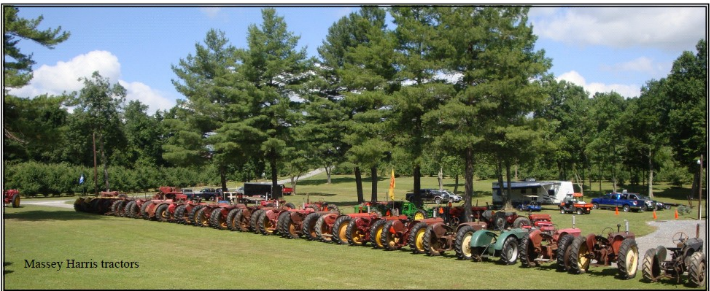
Massey Harris tractors

The following is a breakout of Chris's tractor that were on display. Numerous others were still in the garages. Pony(2); Gray Pony (1); Pacer (1); 20 (2); 81 (2); 22 (1); Colt (1); 101 JR (6); 30 (2); 101 SR (2); 33 (3); 44-6 (1); 44 (2); 44 Propane (1); 44 Special (1); 333 (2); 333 Diesel (1); 333 propane(1); 444 (1); 444 Propane (1); I-244 US Air Force Sweeper (1); I-162 US Air Force Corp of Eng. Industrial (1); I-162 US Army (1), and MF 135 Orchard (1).