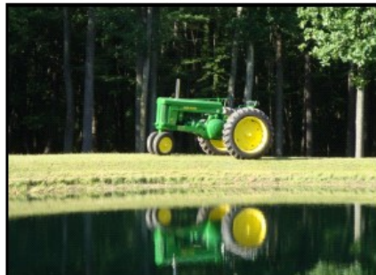
And yes, we do allow other brands of tractors. Pictured above is a beautifully restored JD 60 owned by Shawn Kessel