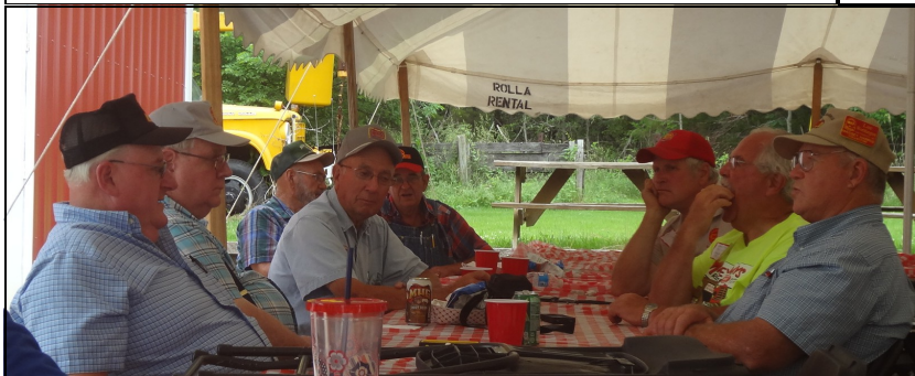
A favorite past time. Swapping knowledge and stories.