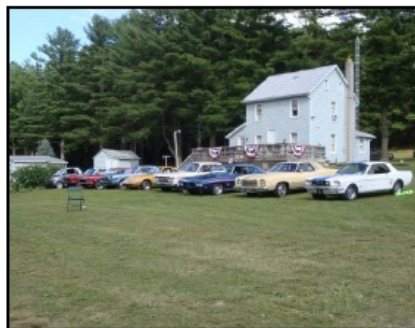
Few of the antique cars