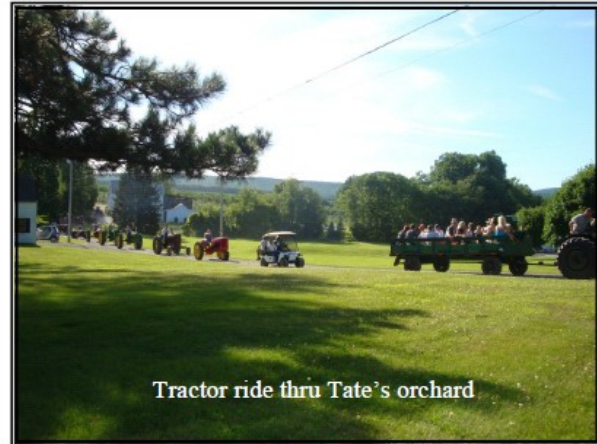
Tractor ride thru Tate's orchard