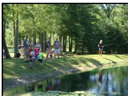
Fishing in the pond